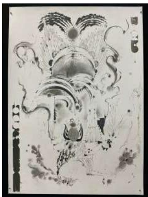
Paulina Nolte, Persimmon's Castle, 2021, pencil and coal on paper, 70x 50cm