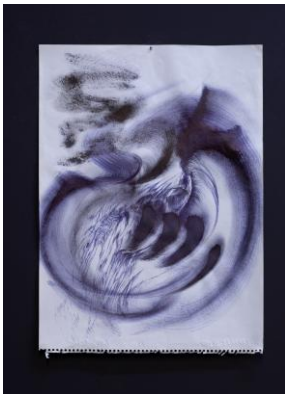
Maria VMier, In Praise of the Dancing Bodies [blue-black], 2021, ink on newspaper, 53,4x 38,5 cm