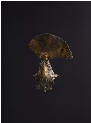
Paulina Nolte, Persimone, 2021, bronze casting, polished, unique, ca. 18x 14 cm