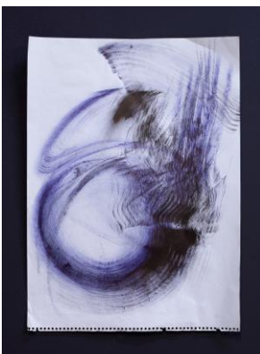
Maria VMier, In Praise of the Dancing Bodies [blue-black], 2021, ink on newspaper, 53,4x 38,5 cm