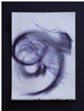
Maria VMier, In Praise of the Dancing Bodies [blue-black], 2021, ink on newspaper, 53,4x 38,5 cm