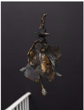
Paulina Nolte, Häväl, 2021, bronze casting, polished, unique, ca. 18x 14 cm