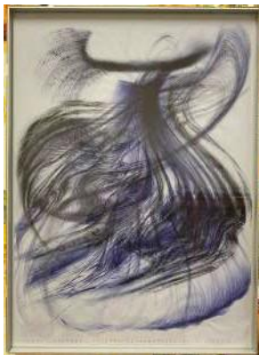
Maria VMier, In Praise of the Dancing Bodies [blue-black], 2021, ink on newspaper, 53,4x 38,5 cm