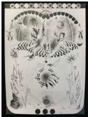
Paulina Nolte, L'Opéra, 2022, pencil and coal on paper, 70x 50cm