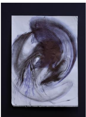
Maria VMier, In Praise of the Dancing Bodies [blue-black], 2021, ink on newspaper, 53,4x 38,5 cm