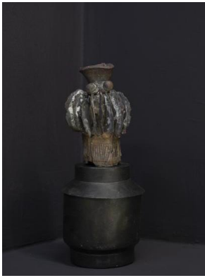
Paulina Nolte, Zola, 2021, bronze casting, polished, unique, ca. 18x 14