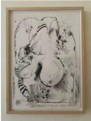
Paulina Nolte, Ein Hut, 2021, pencil and coal on paper, 42x 29,7cm