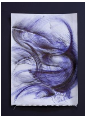
Maria VMier, In Praise of the Dancing Bodies [blue-black], 2021, ink on newspaper, 53,4x 38,5 cm