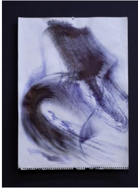
Maria VMier, In Praise of the Dancing Bodies [blue-black], 2021, ink on newspaper, 53,4x 38,5 cm