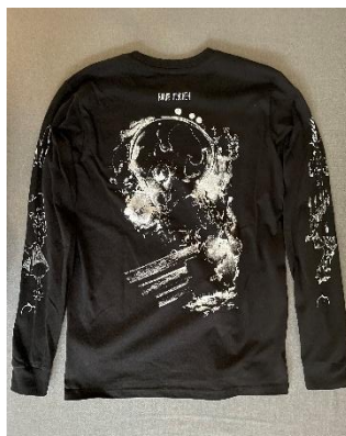
Paulina Nolte, T-Shirt, bedruckt für Ruine München, 2022