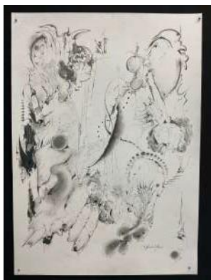
Paulina Nolte, Flora and Creatures on Rock, 2021, pencil and coal on paper, 70x 50cm